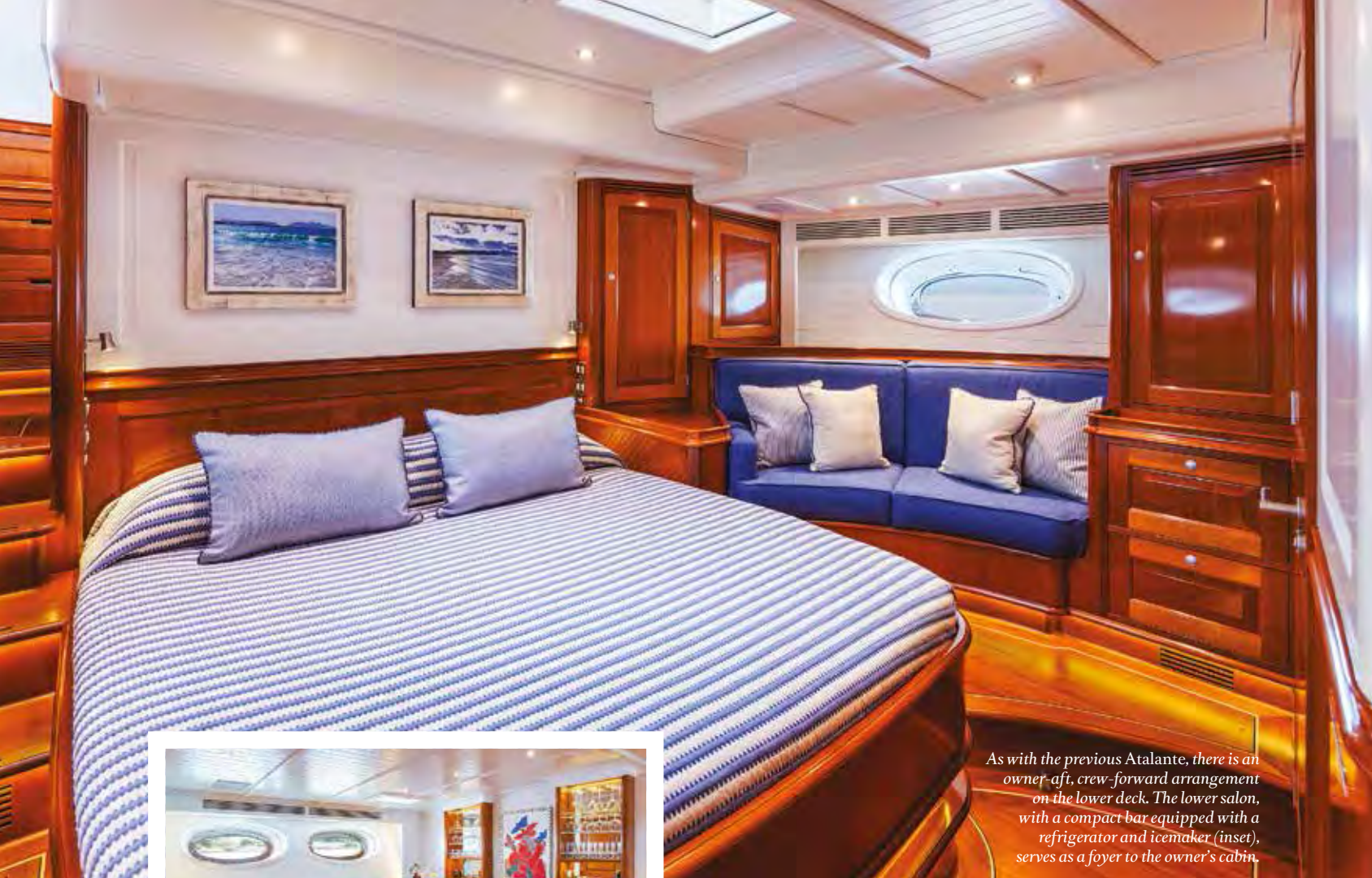
As with the previous Atalante , there is an owner-aft, crew-forward arrangement on the lower deck. The lower salon, with a compact bar equipped with a refrigerator and icemaker (inset), serves as a foyer to the owner's cabin.